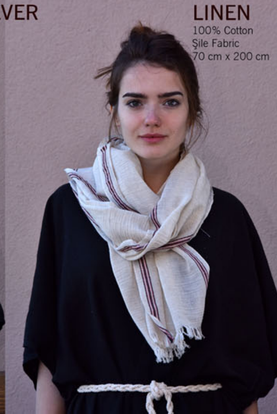
LINEN 100% Cotton Şile Fabric 70 cm x 200 cm