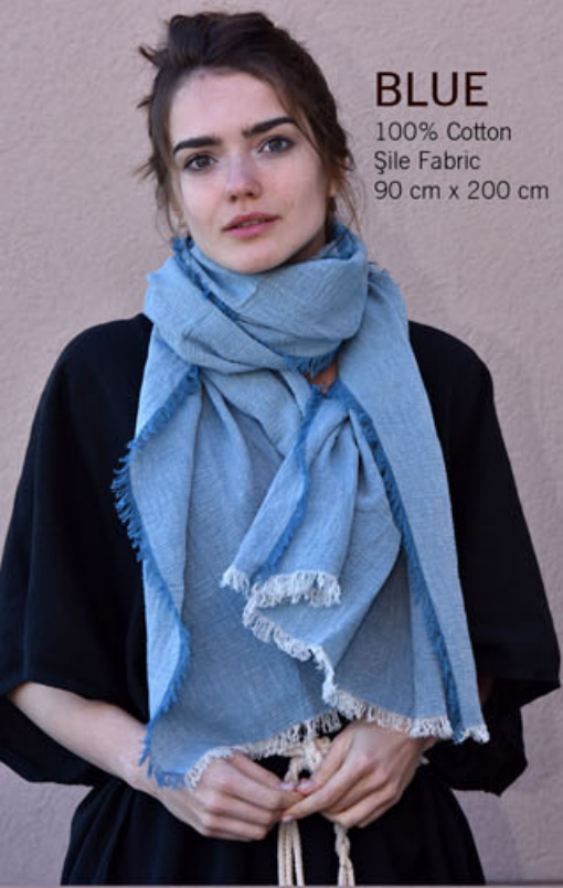
BLUE 100% Cotton Şile Fabric 90 cm x 200 cm