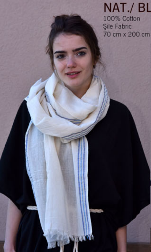
NAT./ BLUE 100% Cotton Şile Fabric 70 cm x 200 cm