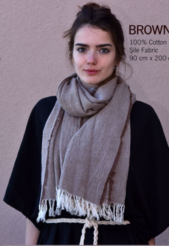
BROWN 100% Cotton Şile Fabric 90 cm x 200 cm