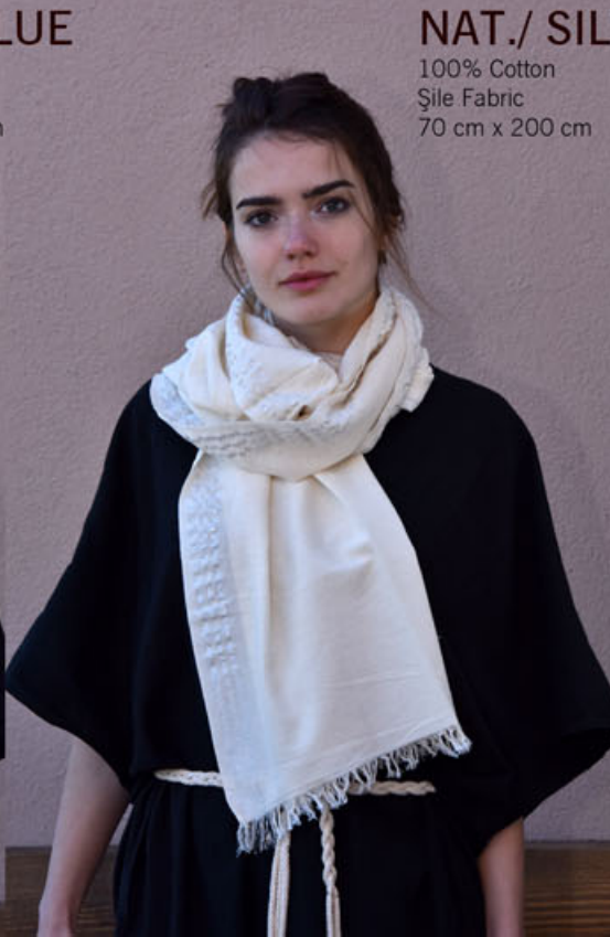
NAT./ SILVER 100% Cotton Şile Fabric 70 cm x 200 cm