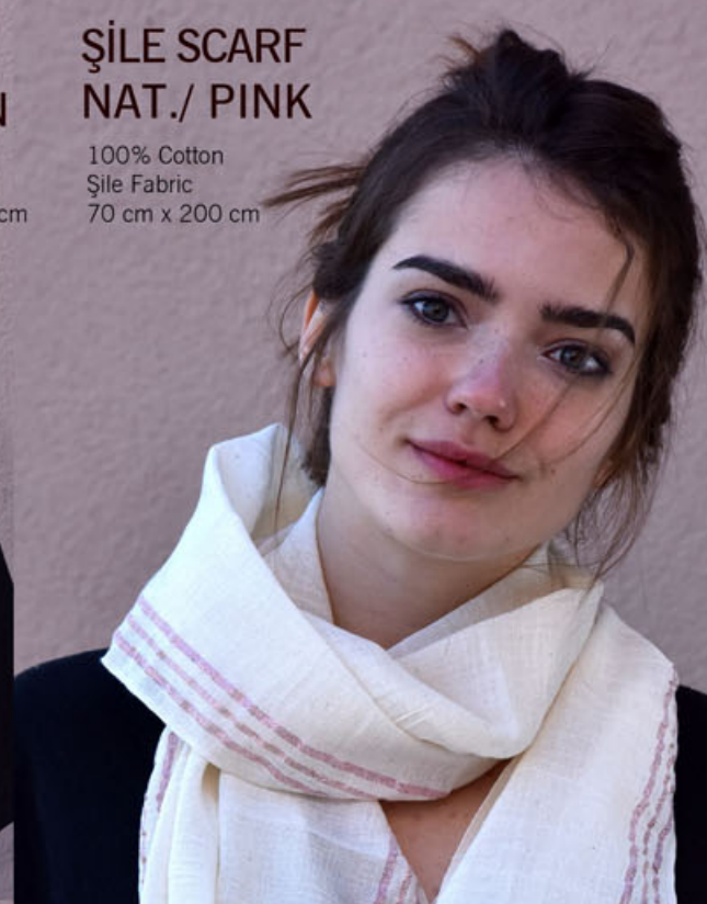
ŞİLE SCARF NAT./ PINK 100% Cotton Şile Fabric 70 cm x 200 cm