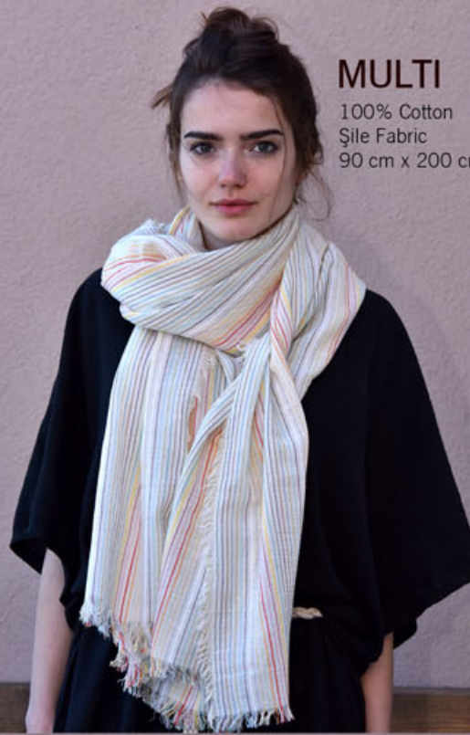
MULTI 100% Cotton Şile Fabric 90 cm x 200 cm