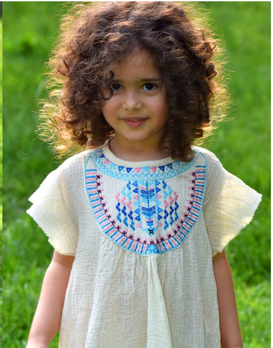
PALMIRA DRESS 2/4 years - 4 / 6 years 100 cotton