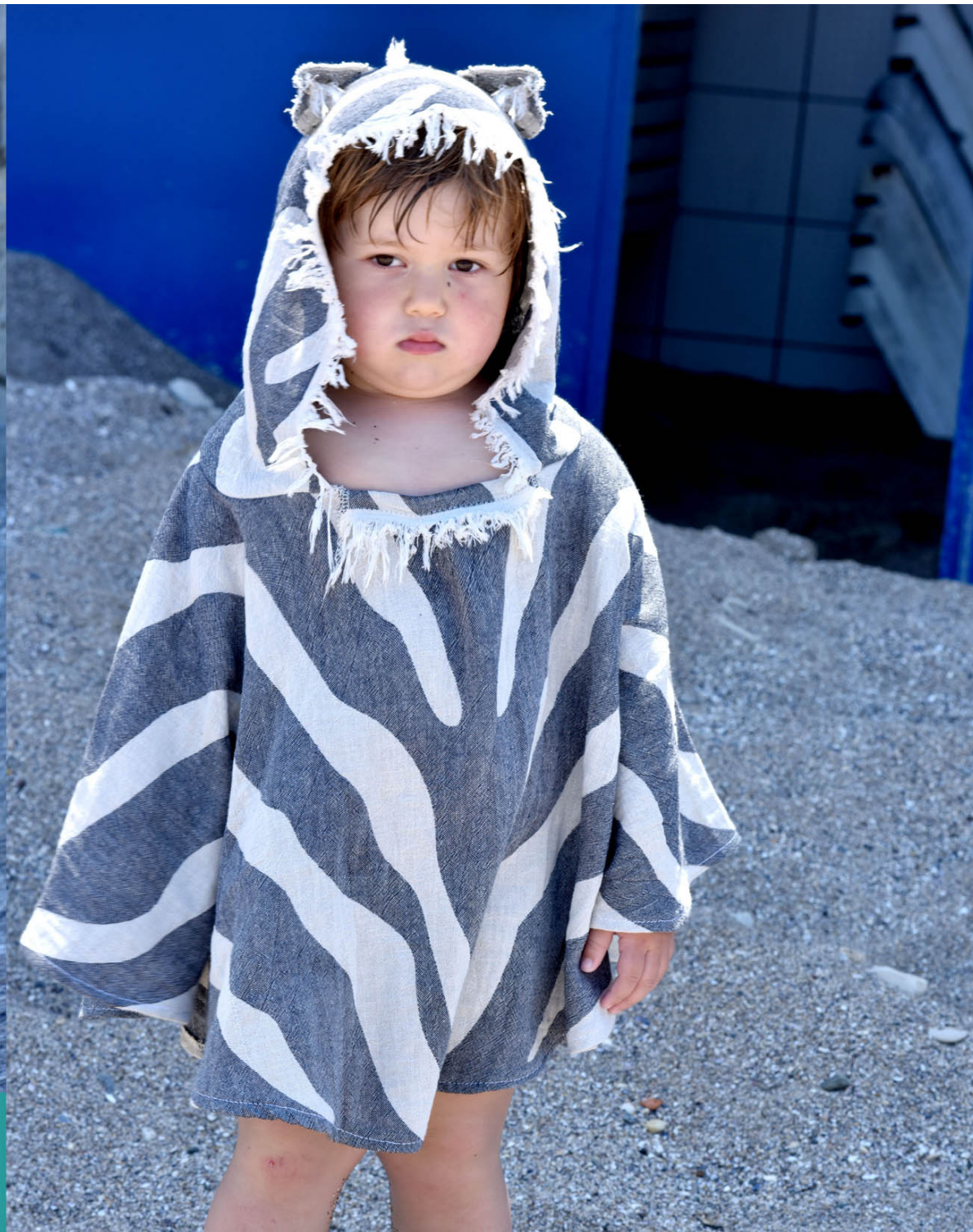
ZEBRA PONCHO 2 / 4 years - 4 / 6 years 100 cotton