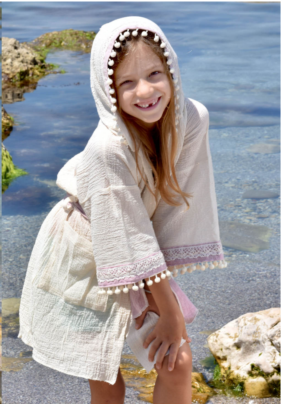
LILY BATHROBE 4 / 6 years - 6 / 8 years 100 cotton